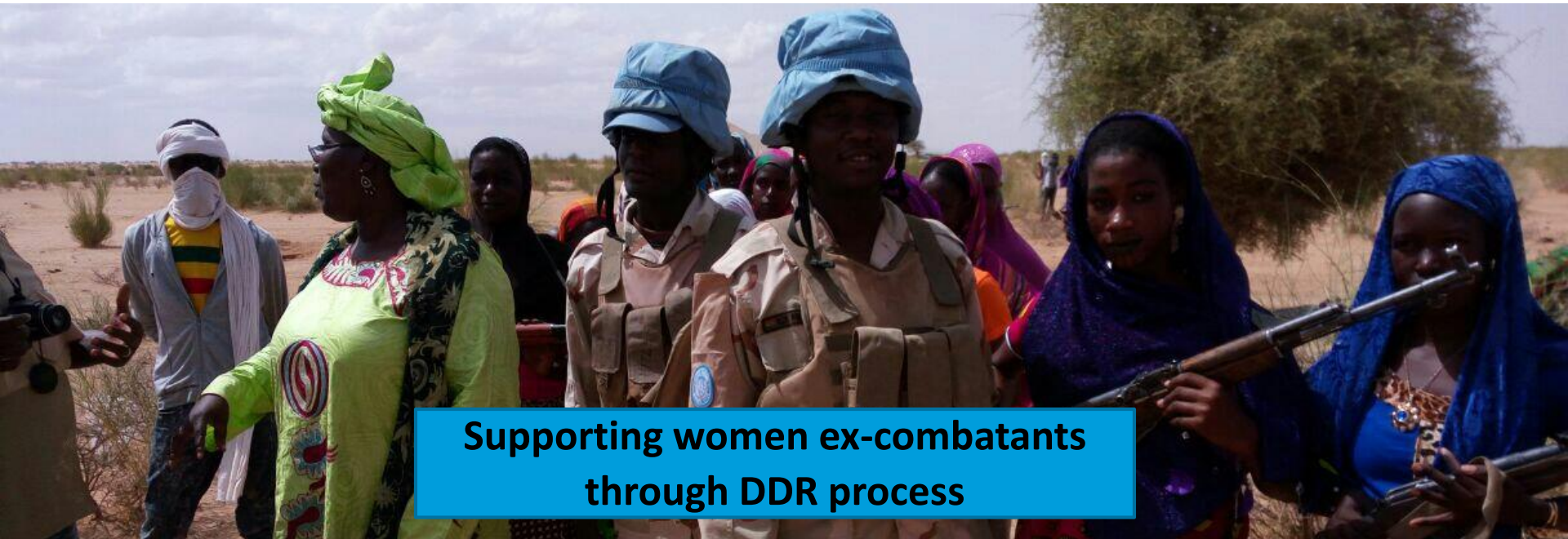
Supporting women ex-combatants through DDR process