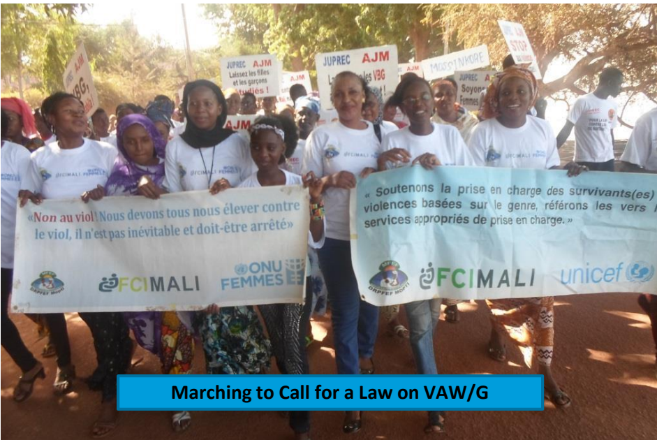
Marching to Call for a Law on VAW/G