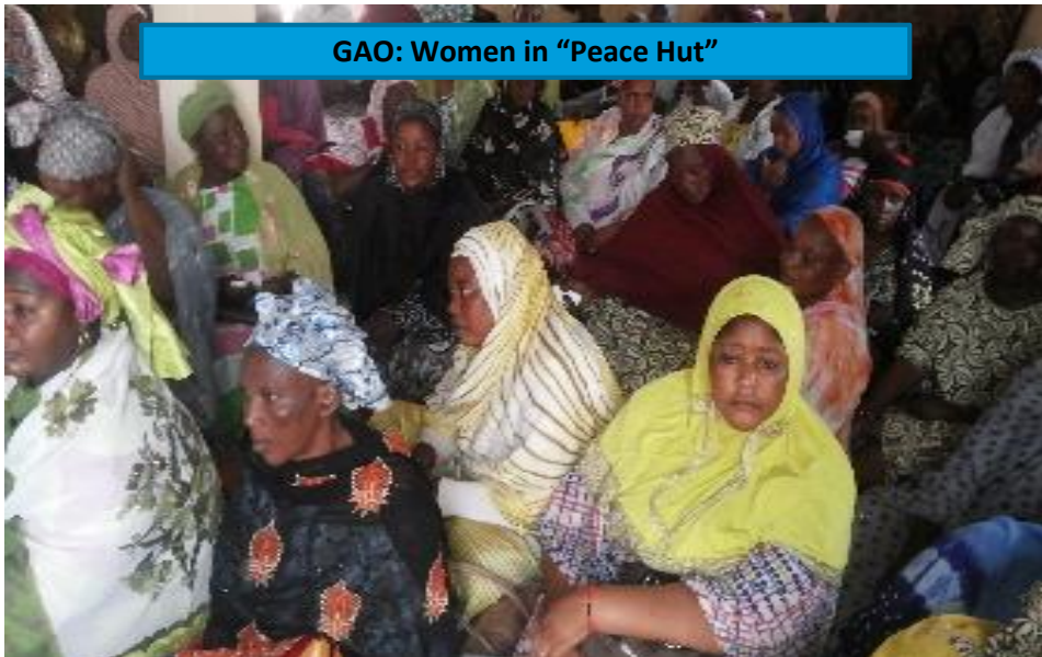
GAO: Women in "Peace Hut"