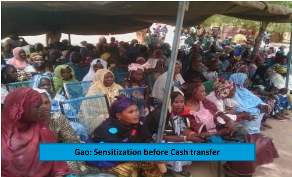
Gao: Sensitization before Cash transfer