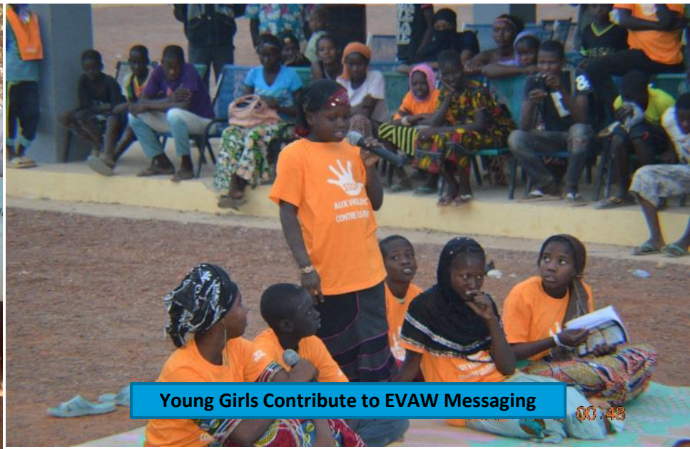
Young Girls Contribute to EVAW Messaging