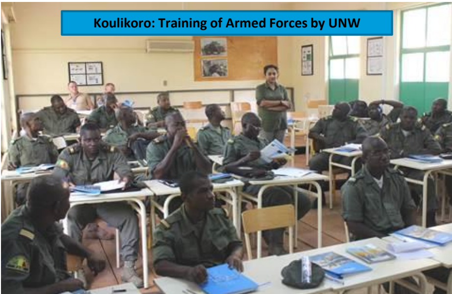
Koulikoro: Training of Armed Forces by UNW