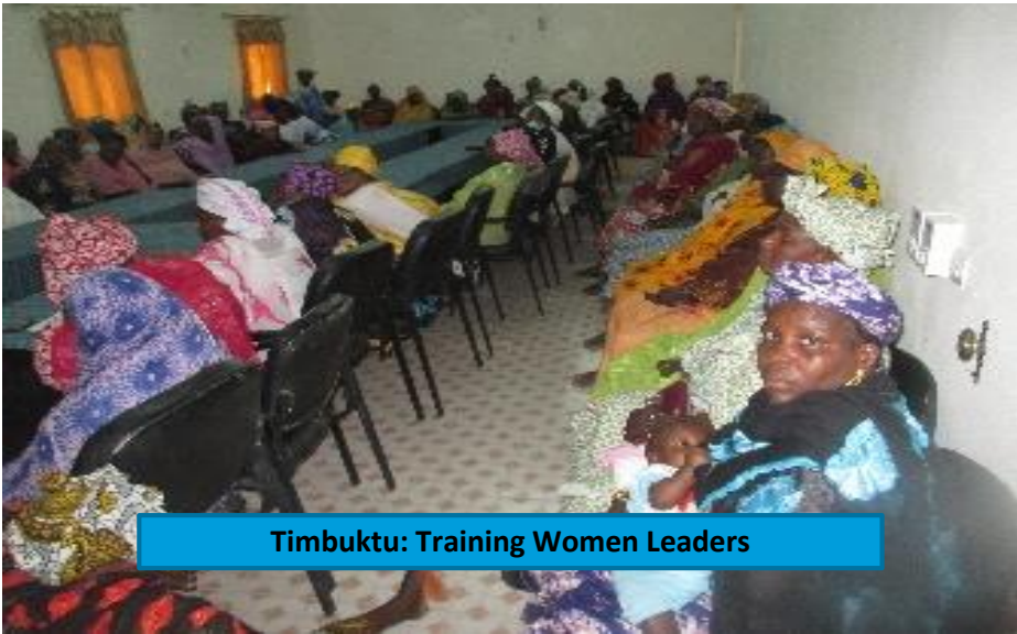
Timbuktu: Training Women Leaders