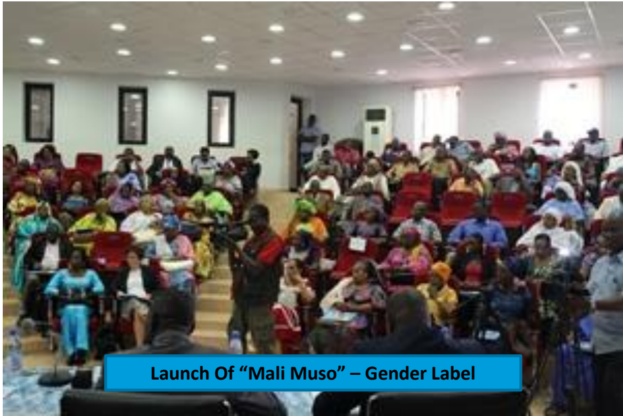
Launch Of "Mali Muso" – Gender Label