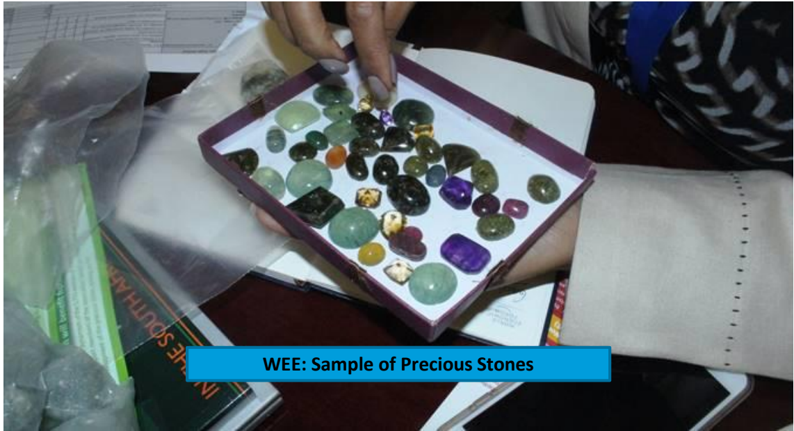
WEE: Sample of Precious Stones